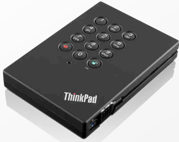
ThinkPad® USB Secure Hard Drive