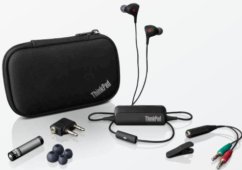
The ThinkPad® Noise Cancelling Earbuds