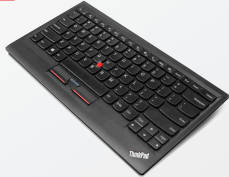
ThinkPad® Wireless Bluetooth® Keyboard with TrackPoint®