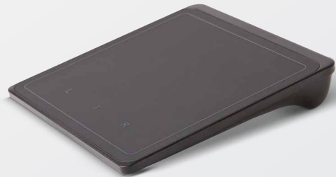
Lenovo® Wireless TouchPad for Windows 8