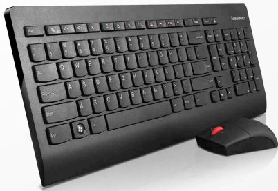
Lenovo® Ultraslim Wireless Keyboard and Mouse Combo (0A340xx)