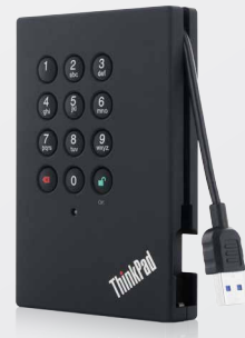
ThinkPad® USB 3.0 Ultraportable Secure HDD (0A65621)