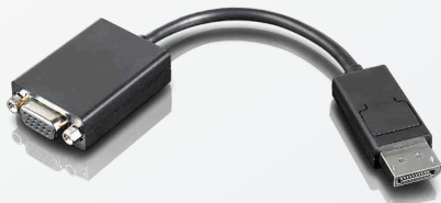
Display Port to VGA Monitor Cable (57Y4393)