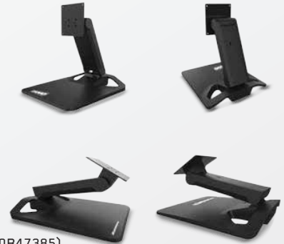
Universal AIO stand (0B47385)