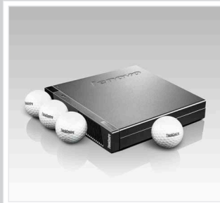
Tiny Form Factor Tiny is as compact as golf ball