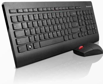
Lenovo® Ultraslim Wireless Keyboard and Mouse Combo (0A34032)