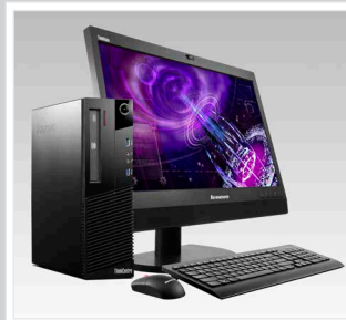
Graphic Experience life-like video quality with discrete graphics up to NVIDIA® Quadro® 410 4