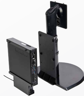
ThinkCentre® Tiny L-Bracket Mounting Kit (0B47096)