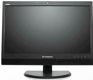
ThinkVision® LT2323z Monitor