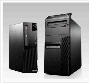
Small Form Factor Pro Expandability and functionality of a mini-Tower at just 50% of the size