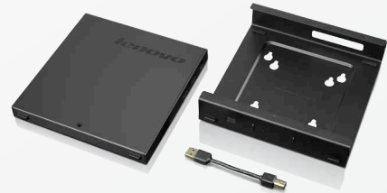
ThinkCentre® Tiny Storage Unit (0A65637)